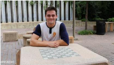
SHOT 2: MEDIUM - INTERVIEW