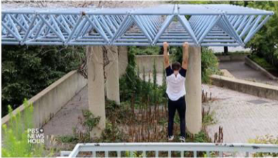
SHOT 5: WIDE - HANGING