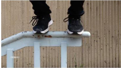
SHOT 4: CLOSE UP - FEET