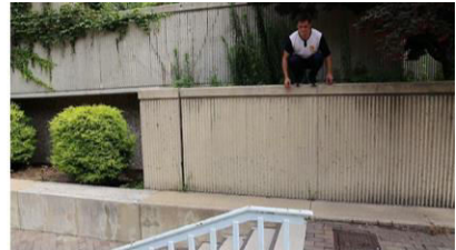
SHOT 3: WIDE - JUMPING