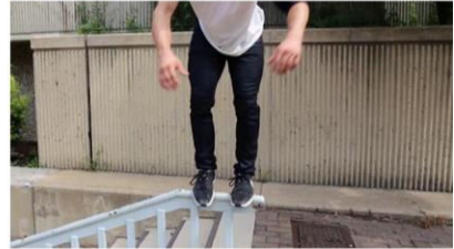
SHOT 6: MEDIUM - LANDING

10. Which camera is breaking the 180° Rule?